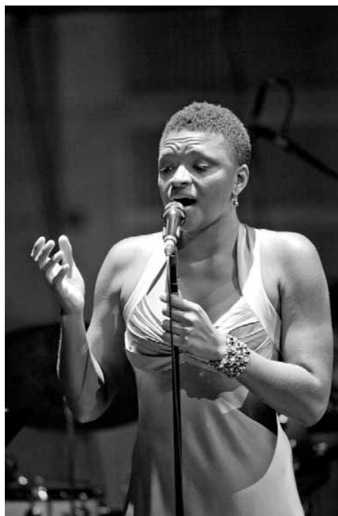
Lizz Wright sings from her album, Salt , produced by Tommy LiPuma.