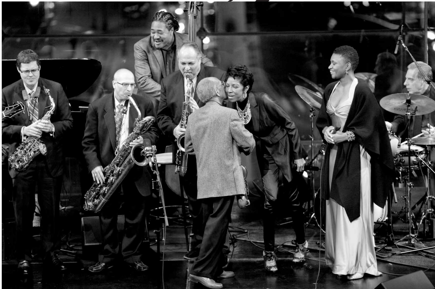
The Finale: The love for Jimmy Heath and Tommy LiPuma overflowed at this year's WBGO Champions of Jazz gala. It was palpable all evening, but came to a crescendo during the evening's musical finale, as all the musicians returned to the Jazz at Lincoln Center stage.