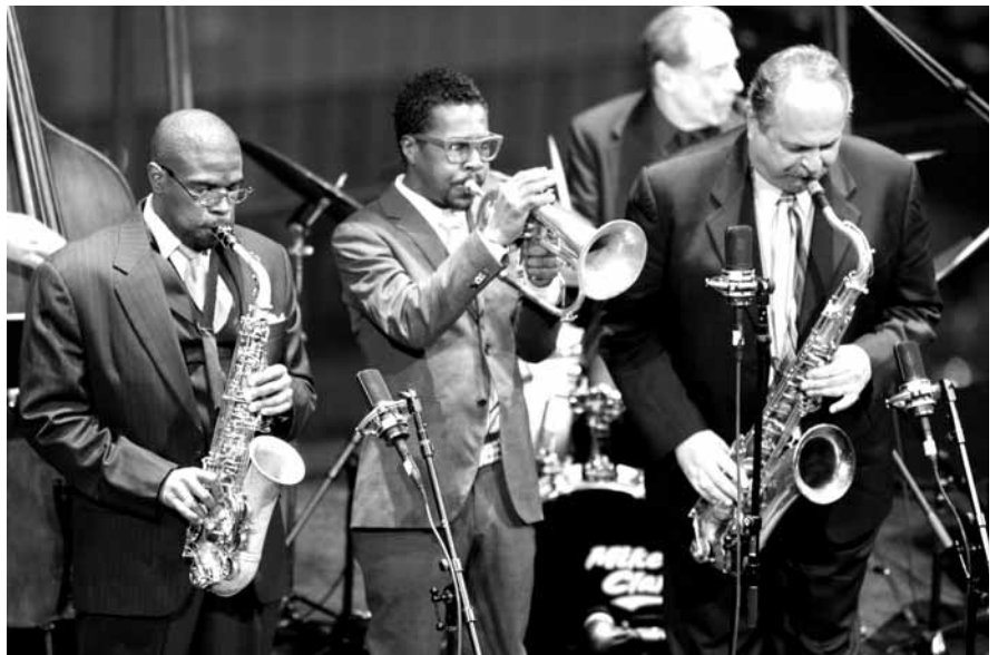
Antonio Hart, Roy Hargrove and Joe Lovano play "What is this Thing Called Love?" at the gala.