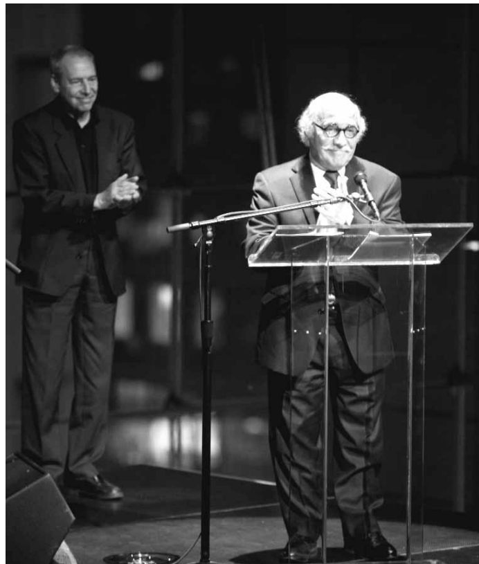
Tommy LiPuma accepts the Champions of Jazz Award. Ben Sidran presented it to Tommy and spoke of how much he means to the musicians with whom he's worked.